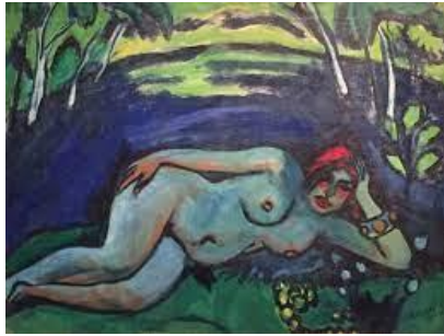
Max Pechstein, Früher Morgen, 1911

We look forward to hearing from you and ask you to register at the association office by e-mail info@freundedeskunstmuseums-rv.de for the online events. You will receive a confirmation of registration with the access information by e-mail.