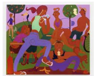
Grace Weaver, lust for lite, 2015